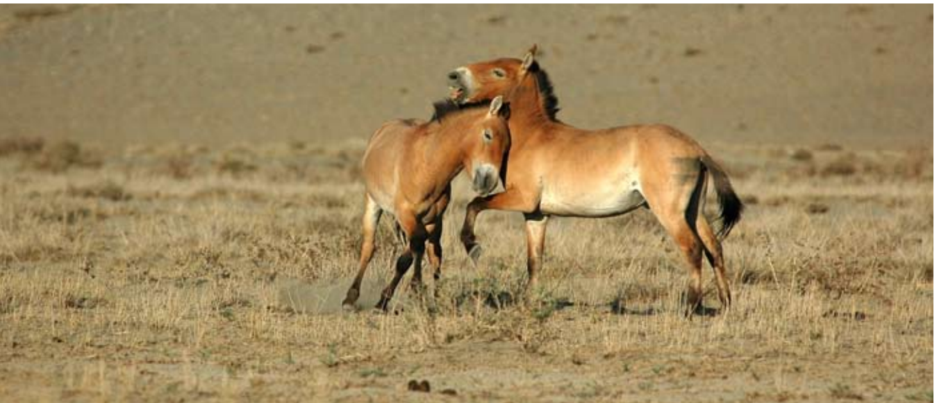
Two young Przewalski's horse bachelors testing each other's strength.

Public and media interest focused heavily on the international transports from Europe to Mongolia. However, the establishment of a permanent field station with the necessary infrastructure (solar power, laboratory, office, vehicles and petrol) and communication abilities (VHF communication, satellite-based e-mail and telephone) proved equally important. In 2004, the Takhiin Tal camp hosted the second international workshop on the reintroduction of the Przewalski's horse. In 2005 facilities at the Takhiin Tal camp were further upgraded with the construction of the SPA headquarters funded by the Austrian Ministry of the Environment and ITG. Facilities now allow year-round living and research. The camp provides training possibilities for young Mongolian and international scientists, has created local employment options and is run by well-trained and motivated local staff.