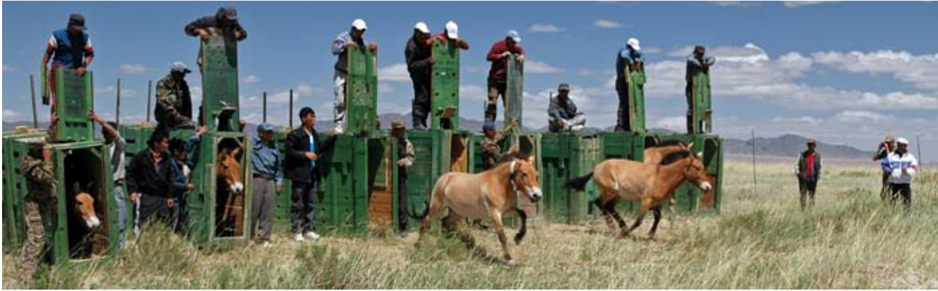
Release of Przewalski's horses in Takhi Us after translocation from the Takhiin Tal area.