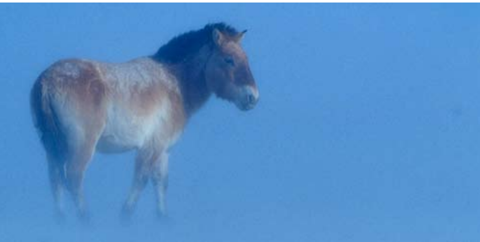
A Przewalski's horse stallion waiting out a snowstorm (© Chris Walzer/ITG).