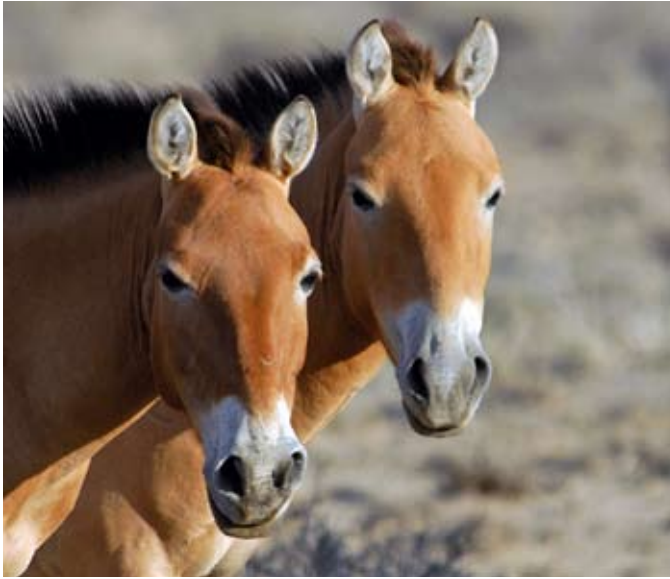
Two young Przewalski's horse mares keeping an eye on the researcher.

Research has also focused on socio-economic aspects of local herders, their impact on the SPA and its surroundings, and their attitude towards wildlife and management issues. In 2005 training workshops on the construction and application of fuel-efficient stoves was conducted in order to reduce the pressure for illegal saxaul and juniper collection. In 2006 a concept for environmental education for children in Takhiin Tal was developed, yet still needs to be implemented. In 2007, with support from the Italian region of Lombardia and under the lead of the Instituto Oikos, a trans-boundary project in collaboration with the Xinjiang Institute of Ecology and Geography of the Chinese Academy of Sciences was initiated. This project aims to support rural communities of nomadic pastoralists living in the trans-boundary area of the Dzungarian Gobi in China and Mongolia and investigates the possibilities of expanding the ranges of the Przewalski's horses and the Asiatic wild ass across the international border. Local livelihoods will be improved through the strengthening of international collaboration on sustainable development issues and the integration of an environmental component in the respective development processes. The project currently seeks additional funds to further strengthen local involvement and community development in the project area.