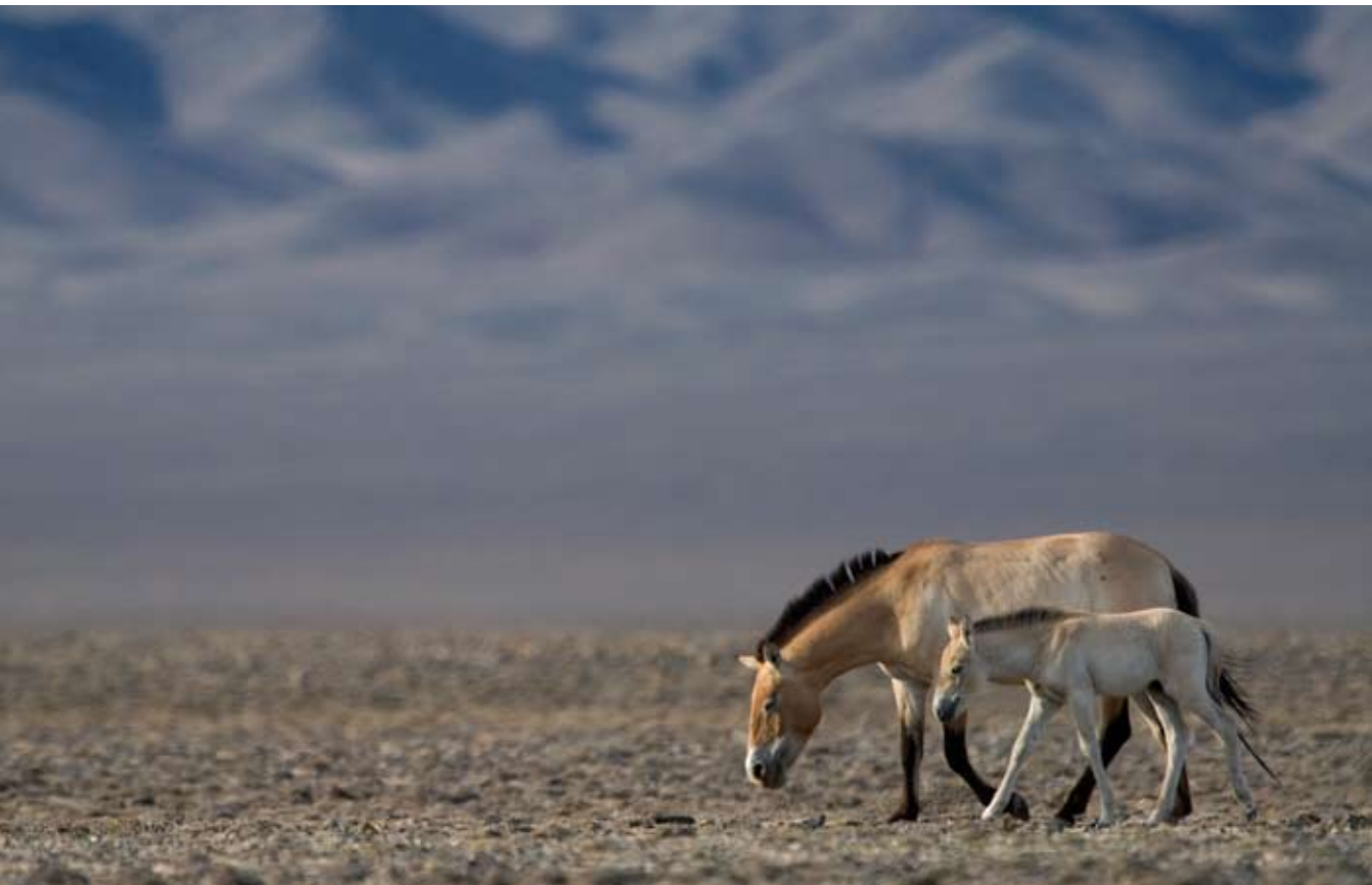
A Przewalski's horse mare and her newborn foal crossing the plains (© Chris Walzer/ITG).

The Przewalski's horse ( Equus ferus przewalskii ), "takhi" in Mongolian, became extinct in the wild during the 1960s. The very last recorded sightings of the Przewalski's horse in the wild occurred in the Dzungarian Gobi of south-western Mongolia. The takhi only survived thanks to captive breeding based on 13 founder animals. The reasons for the extinction of Przewalski's horse are seen in the combined effects of pasture competition with livestock and overhunting. Subsequent to the establishment of the Przewalski's horse studbook at Prague Zoo and the initiation of a European Endangered Species Programme under the auspices of Cologne Zoo, the captive population grew to over 1,000 individuals by the mid-1980s. This fact was an important prerequisite to initiating a reintroduction programme.