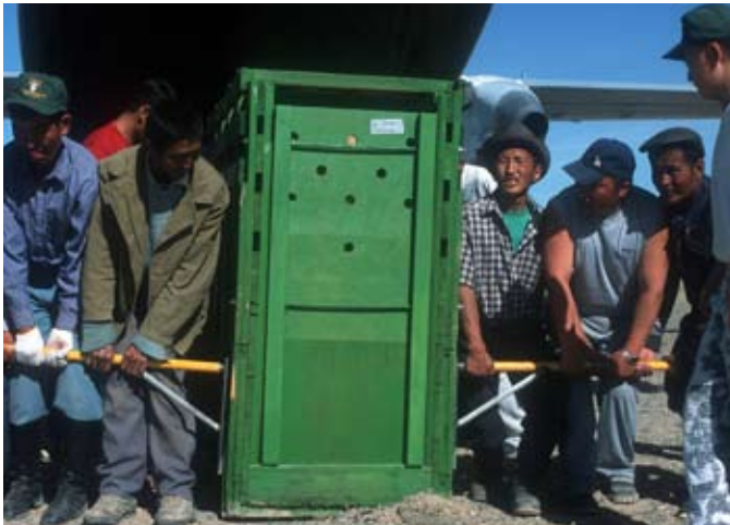
Unloading a crate with a newly arrived Przewalski's horse at Takhiin Tal.

The 9,000 km 2 Great Gobi B SPA was chosen as the reintroduction site. This SPA was established in 1975 and encompasses some 9,000 km 2 of desert steppes and semi-deserts. Plains in the east and rolling hills to the west dominate the landscape, with the mighty Altai Mountains flanking the park in the north. The Takhin Shar Naruu mountain range in the south forms the international border with China. Elevations range from 1,000 to 2,840 m. The climate is continental with long cold winters and short hot summers. Average annual temperature is a frigid 1°C and average annual rainfall a mere 96 mm. Snow cover lasts an average of 97 days. Defining factor for this landscape is that rain and snowfall are highly variable in space and time. Open water (rivers and springs) is unevenly distributed with almost no water in the central and western part of the SPA.